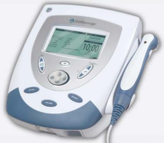
Intelect RPW 2 Shockwave