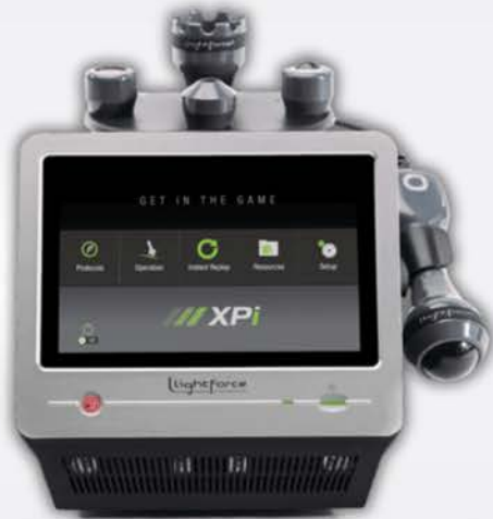
LightForce XPi 25W Laser Machine